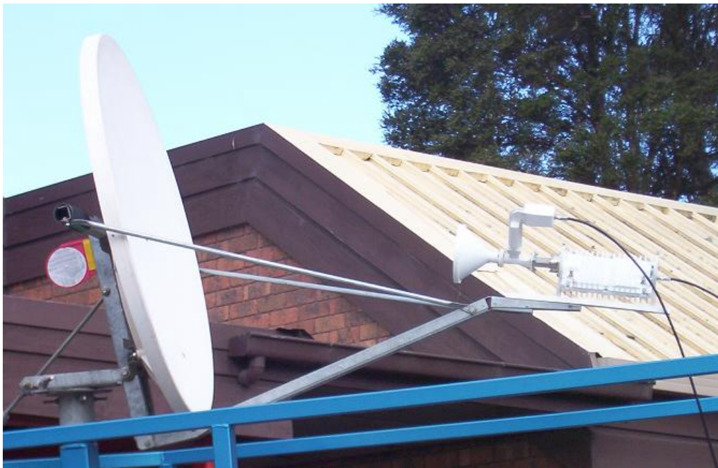
Product or Service Image