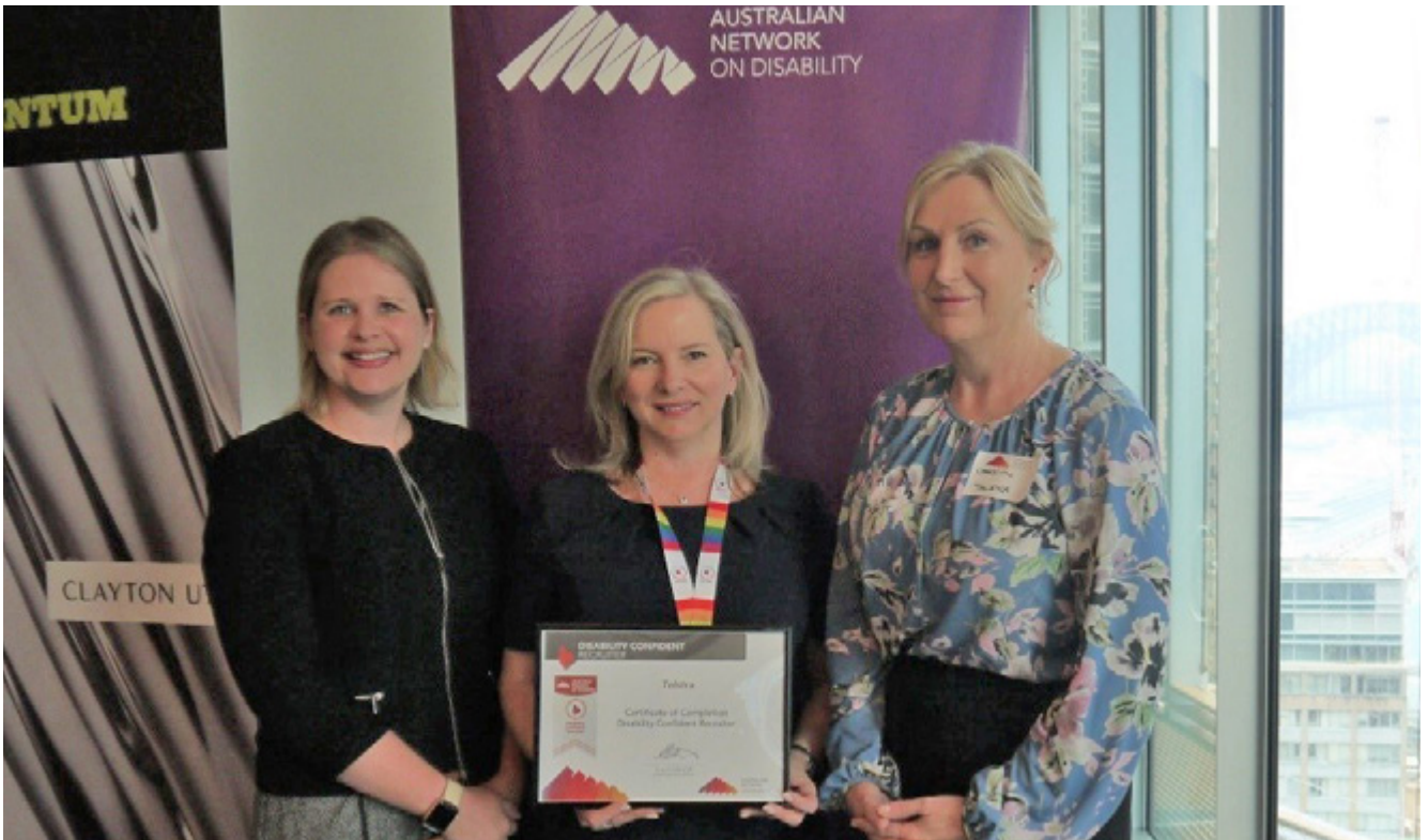
*Photo taken prior to the introduction of physical distancing requirements