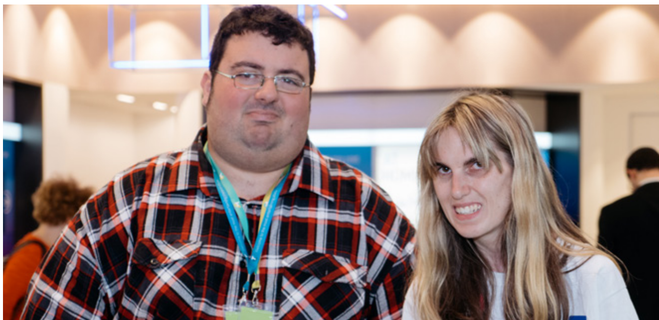
*Photo taken prior to the introduction of physical distancing requirements